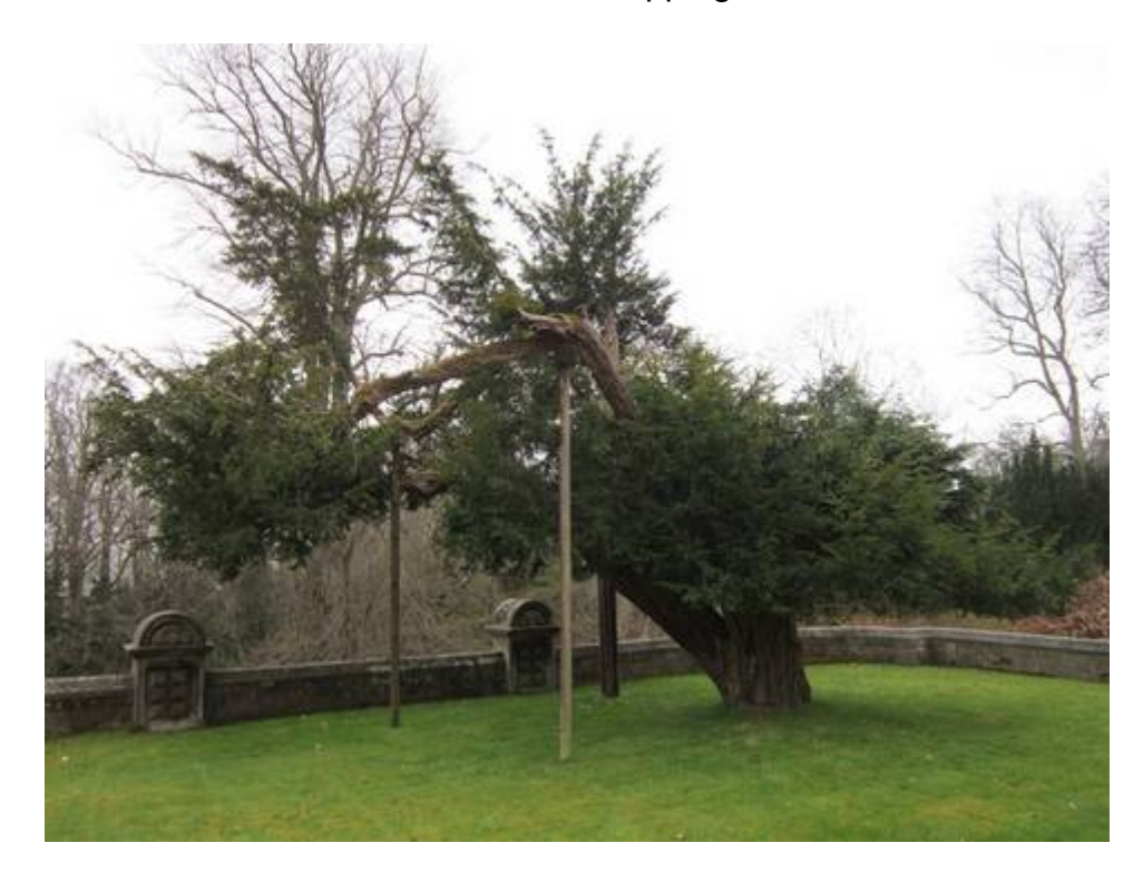
Bracing (though will need to be reviewed for careful removal: see banding beginning to 'cut' into the trunk)