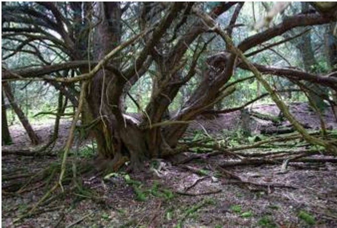
Tree 2 SU7549214240 F 12' 0"