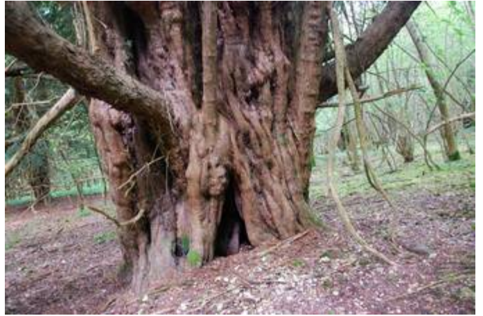
Tree 7 SU7556814366 Male 14' 11"