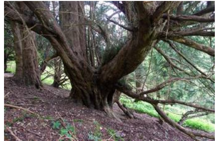
Tree 5 SU7538314231 M 12' 3"