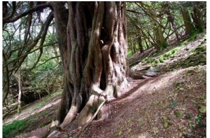
Tree 12 SU7572714279 M 14' 8"