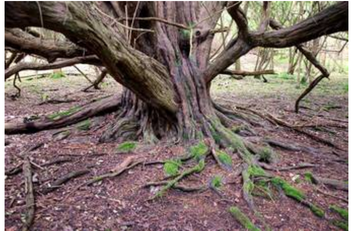
Tree 9 SU7561414394 F 14' 7"