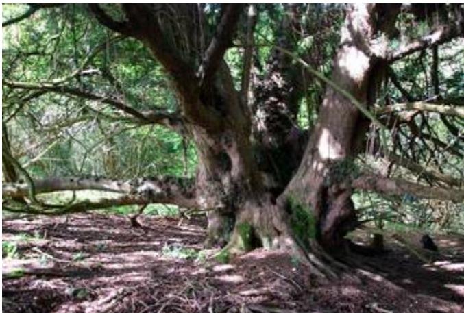
Tree 4 SU7532914174 F 12' 5"