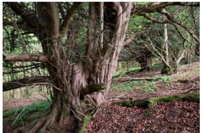
Tree 3 SU7540614188 F 16' 1"