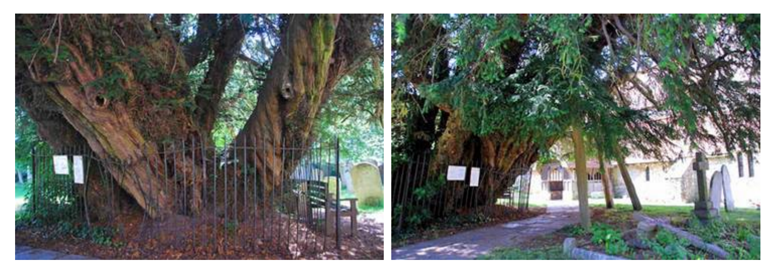
Warblington - St Thomas a Becket - SU728054

This large multi-limbed and hollowing propped female grows close to the south porch. In 1984 Meredith recorded a girth of 33' 8" at about 2'. Apart from the ancient yew, a further 14 are scattered about the churchyard. Most measured between 8' and 11', though the male close to the southeast gate was 12' 9" at the root crown.