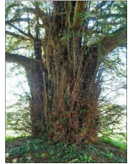
A veteran yew, with a girth of about 18', is number 3 on the plan. It is seen above right in 2012.