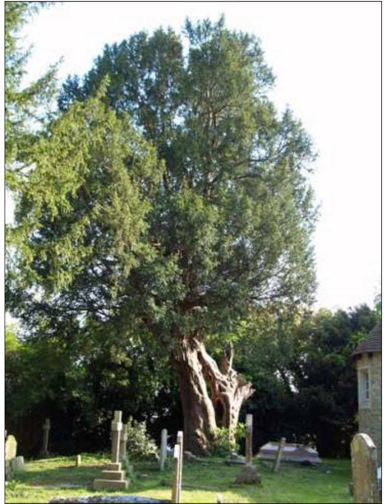
Tim Hills - Ancient Yew Group - 2019