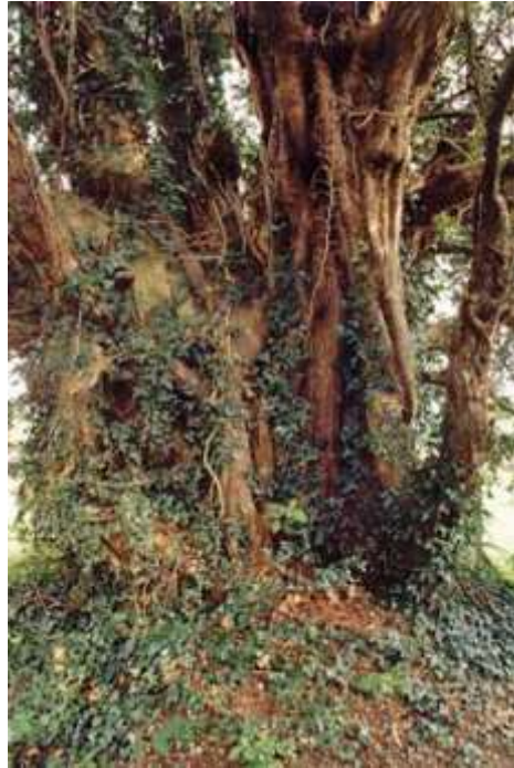
1999 - Tim Hills