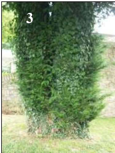
Tree 3, SE of the church, is triple stemmed from a platform within the centre at about 3'. Ivy and twiggy growth meant that only a base measurement could be taken and 12' 4" was recorded.

Tree 2, the notable yew, grows by the perimeter wall that leads to the Manor House. This wall has been especially curved to allow for the female yew's expansion. The side of the tree facing the church has been truncated at a height of about 10'. Girth was exactly 14' close to the ground, trying to obtain the lowest measurement over thin ivy. Also 12' 5" at 3' above the highest ground will also have been affected by ivy.