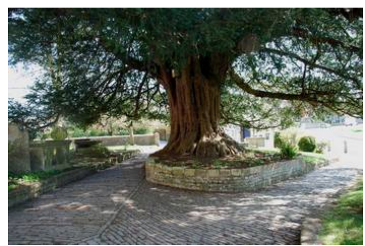
Upton Scudamore - St Mary the Virgin - ST8647

The church of St Mary the Virgin stands on the site of a smaller Anglo Saxon church. The tower was rebuilt in 1750 and the church was extensively remodelled in the 19th century.