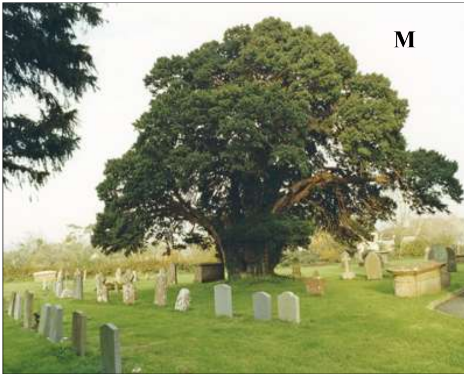
The male yew - 1999

The female yew was described by Collinson in 1791 as dividing into 'three large trunks just above the ground, but many of the arms are decayed'. It was recorded for Lowe in 1895 with a girth of 17' 9" at the ground and 20' at 3'.