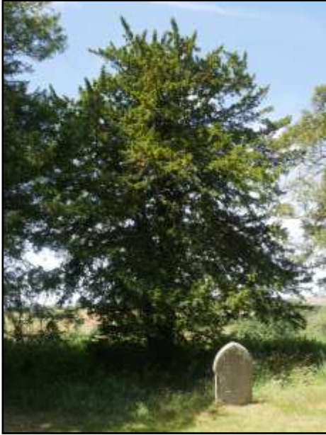
Tree 7 - tall and small girthed