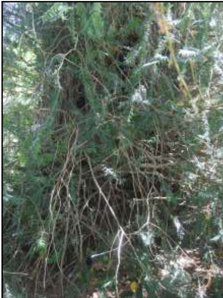
Tree 13 - possibly notable Unable to measure