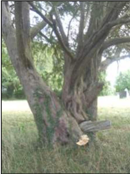
Tree 4 - 10' 5" at 1'