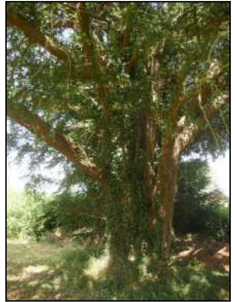
Tree 15 - 12' 11" at 1' over ivy The only female