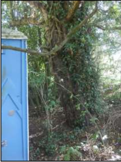
Tree 10 - young