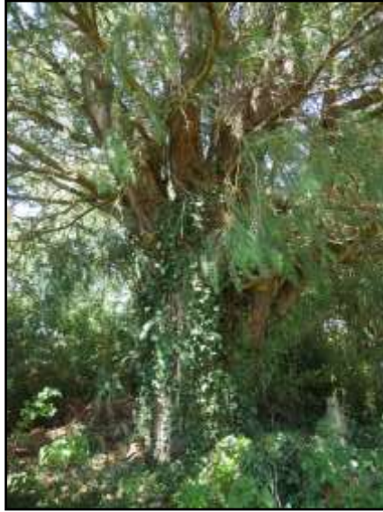
Tree 11 - 11' 3½" at 2'