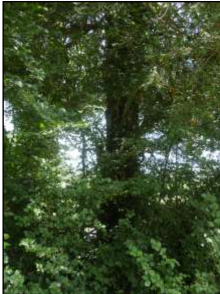
Tree 14 - straight trunk - small girth