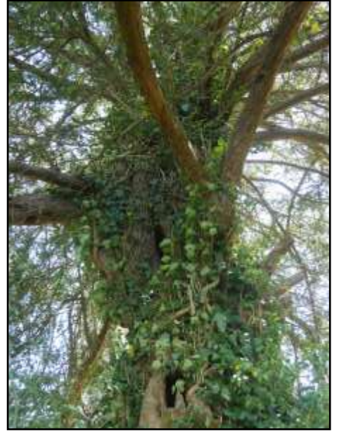
Tree 9 Girth of 12' 7½" at 2'. The tree is hollow on the east side