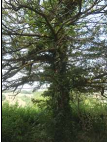
Tree 5 - young - many dead branches