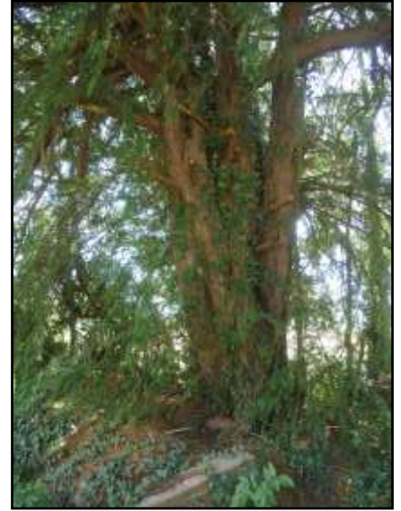
Tree 12 - young