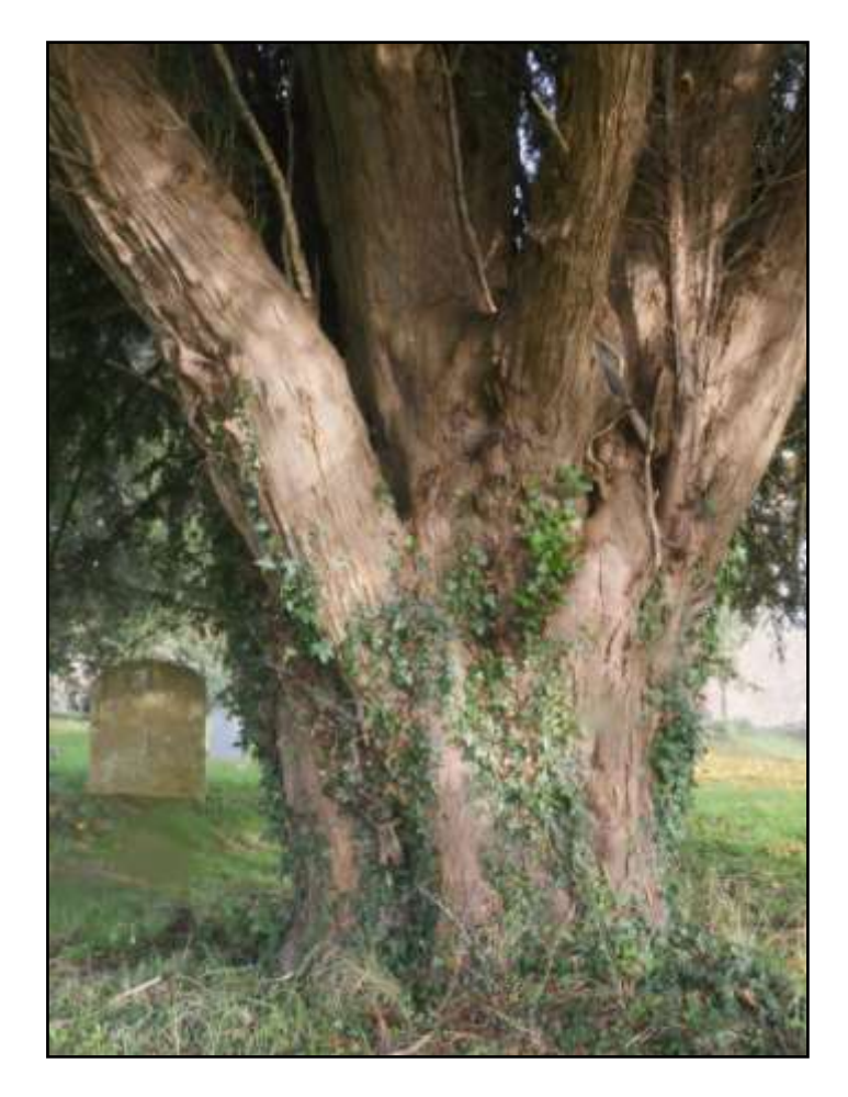
© Tim Hills - Ancient Yew Group - 2020