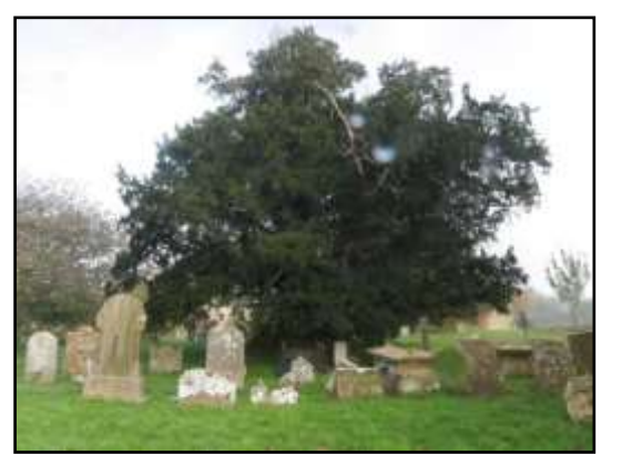
Tree 1 in 2016