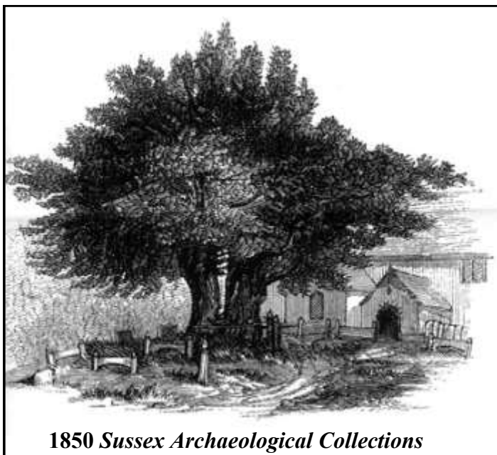
1850 Sussex Archaeological Collections