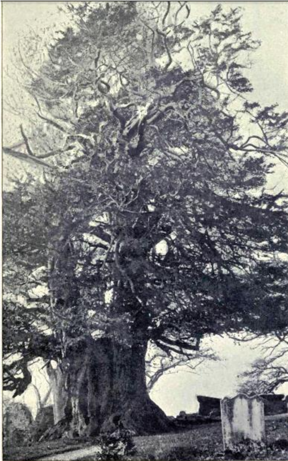
YEW-TREE AT CROWHURST, SUSSEX.

Illustrative photographic plate from Lowe (1896) opposite page 38. The Church stands to the right of the photographer out of shot, the path is still in place. Exposed root butressing is evident 118 years ago and the bole is intact although split and presumably very hollow. The canopy is poor, and has since recovered considerably. See Appendix 2 for an 1896 text example.