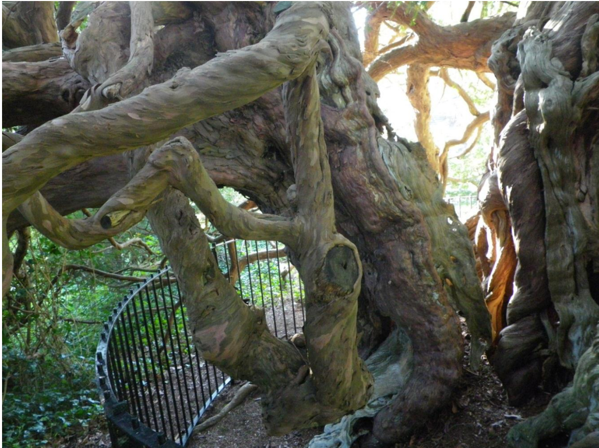
The leaning section. Also note the rare "down-and-up" hanging branch, and internal growths

The leaning section: At the back of the tree, away from the church and towards the sharp slope a large fragment of bole is leaning. This bole section has clearly moved since 1954 when the bole measured 27'2" at 3 feet from ground: that measure is impossible to take now, and reports as far back as the mid-1800s mention the start of the movement (Appendix 2). With the shifting of the section the only level likely to give a true repeat measure now is at the root crown; that has not been done before as far as I know, so no exact comparison can be made. The section will probably come slowly to rest on its railings like a section of the specimen at South Hayling in Hampshire. The rest of the yew facing the church is stable and should also be measured as a separate circumference as in a century it may be the sole remainder of the tree.