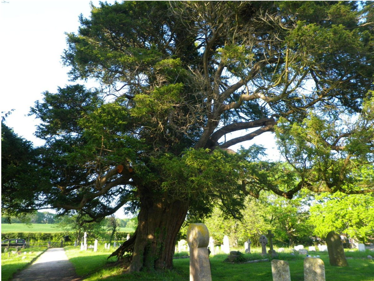
One of the two old yews probably planted by Sir John Pelham shortly after 1412

Girths of the lesser yews: The female yew pictured above has a girth of 17'1" at 2'6/4' from the (sloping) ground along a run of nails, again probably put there by a researcher with a disappointing attitude. At 3'6" from the ground the yew measures 16'11". John Lowe records this yew in 1896: "There is a fine tree, much storm broken, at the north-west corner of the churchyard, which measures 13 feet 10 inches at 3 feet from the ground". (4) This useful reference shows that the yew has grown approximately 3 feet in girth over the last 116 years, a rate of 7.8mm per year.