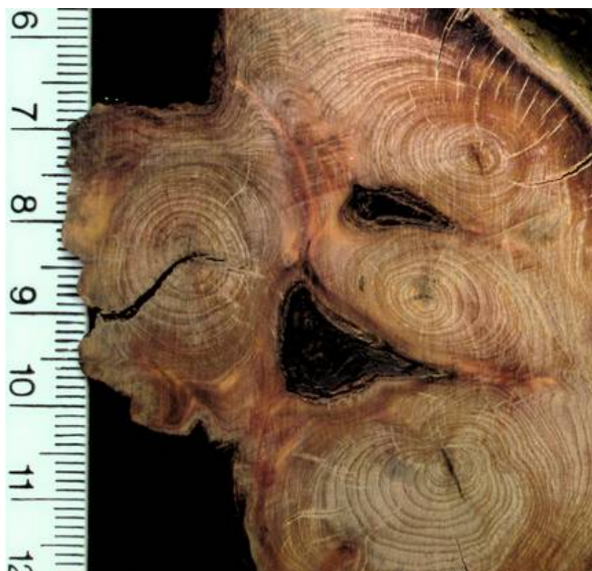
Section of internal stem from CC467r against a cm scale