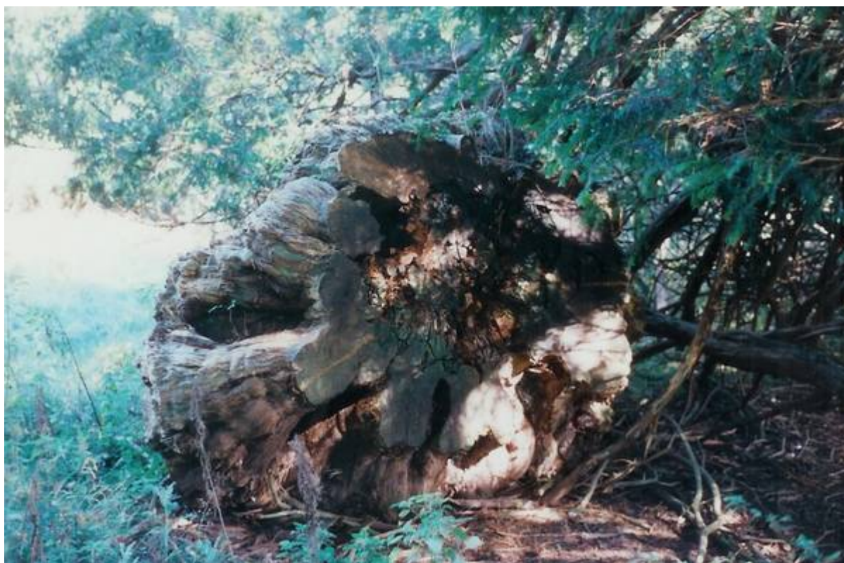
CC467r in 1999. It is over 20 feet in girth at the widest part of the bole.