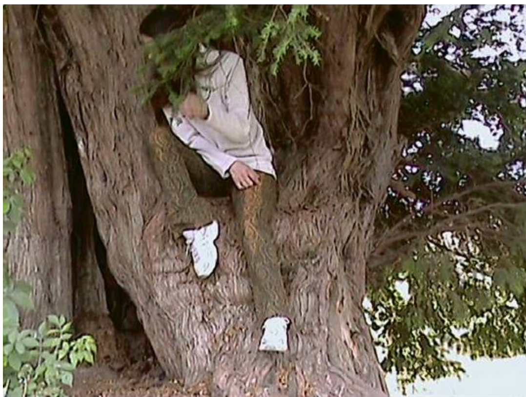
The bole of the largest Bridge Sollars yew showing the hollow 2003.