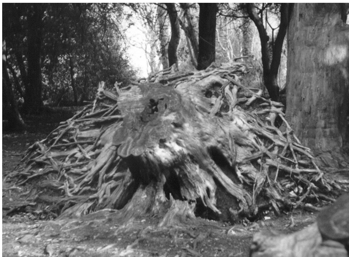
NC201ar in 1997

At Newlands Corner near Guildford a yew was wind felled (hurricane of 1987?) and later cut up. It was 100 yards south of the main hilltop car park in mixed woodland containing yew groves. The girth was 7'8" and the ring count (almost complete, a small section at the centre was rotten) was 201. The yew was C210 years old.