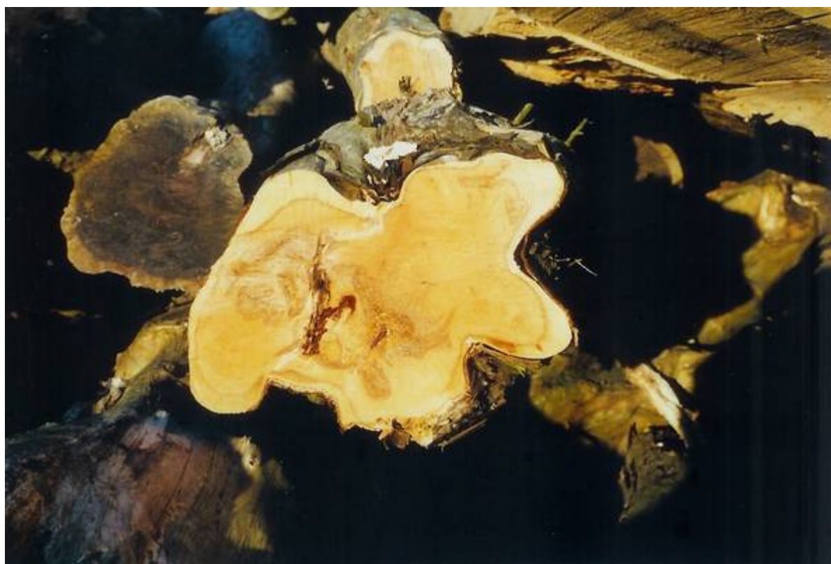
BB278a, the oldest bole ring counted at Herriard Sawmill 1999