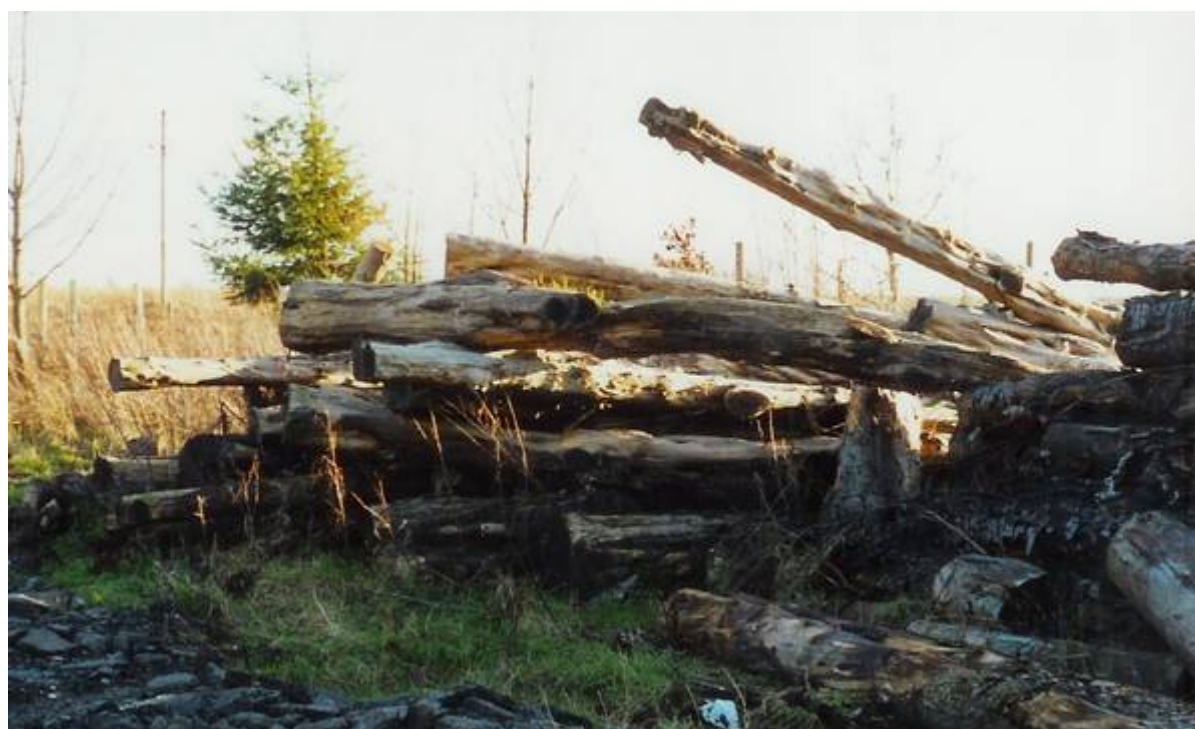
Yew boles at Herriard sawmill 1999

On the Alton to Basingstoke road in Hampshire lies Herriard Sawmill. Driving past on the way to work, I noticed a huge stack of tree trunks ready to be sawn, and realised that they were yew. I spoke to the owner, and he kindly gave me leave to ring count and measure them, even getting his chainsaw out to cut the end off the oldest bole so that I could get a good count. I like people like that. He informed me that the wood came from a wooded hill in the Brecon Beacons, but was unsure of the exact location. I ring counted ten yews, choosing timber of varying size and without central rot. I was then late for work.