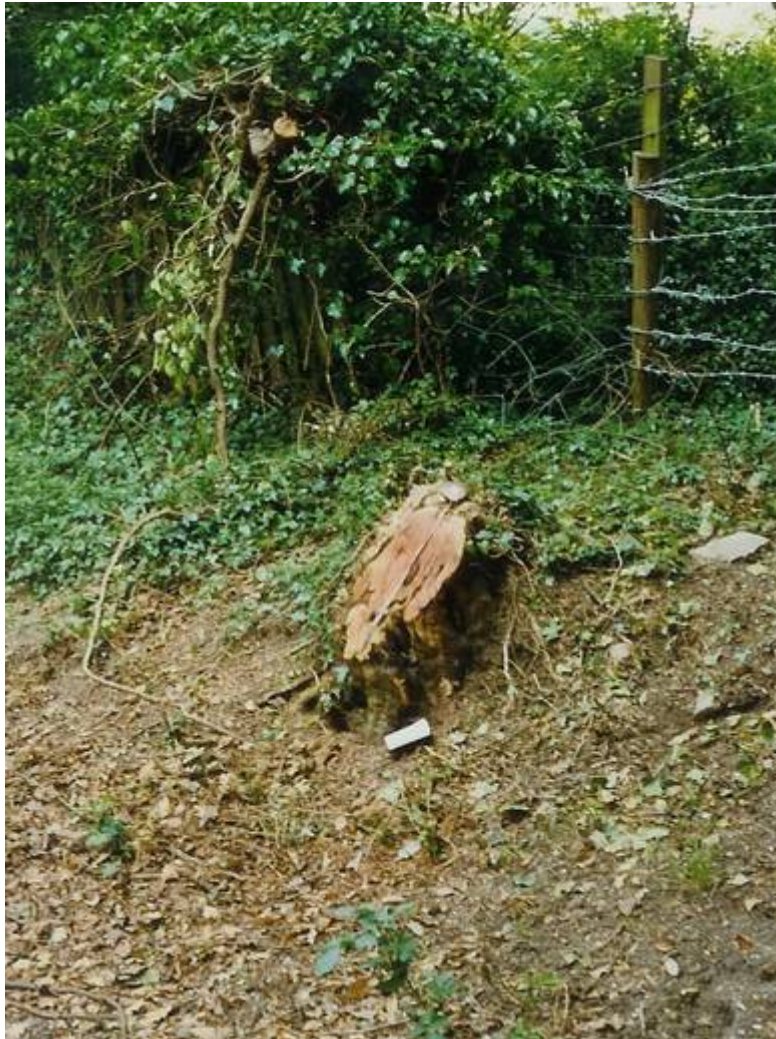
MC133a in 1998

The girth was 5'3" and the ring count and age was 133. Annual girth increase: 0.47 inches, which is 1.2 cm.