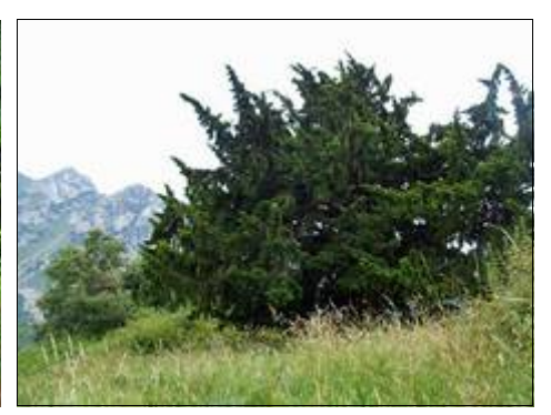
St MARTÍN del Mar

A female yew at the west end of the church, girthing 11' 5" (348cm) above its swollen root.