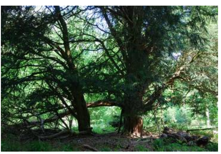
Male 14' 7" at 1'