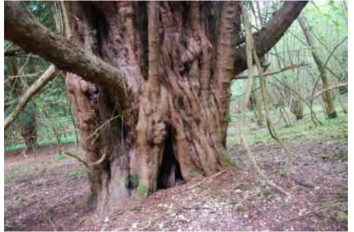
Tree 7 SU7556814366 Male 14' 11"