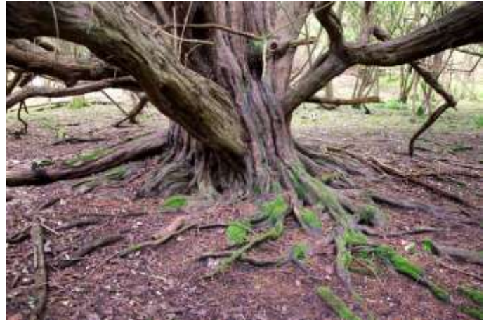
Tree 9 SU7561414394 F 14' 7"