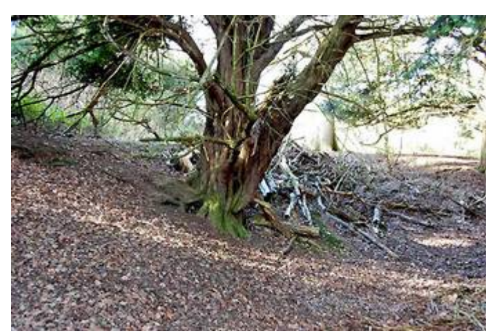
Retrace your steps to the footpath on the incline and follow the track up and around to the left (south). Growing on the west side are two female yews. The first (below left) measured 11' 6" and is missing part of its trunk, revealing many fine internal roots. The second (right) measured 12' 6" and is partially hollow.