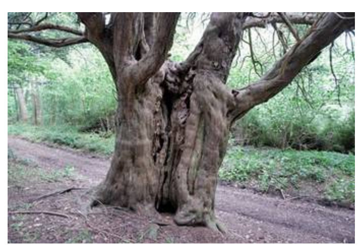
Continue down this footpath and at the end of this wood is found the last yew, a male girthing 9' 8". At the next wood and just inside turn east, head back across the field to ' The Avenue ' and retrace your steps to the church.