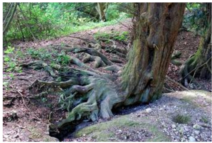
To the south of this track is another chalk pit with a further five yews growing on slopes, with much disturbance around the roots caused by badgers (above right). To the south again is yet another chalk pit (below left) with four yews growing on the slope and another nearby. It is here that 3 of the largest chalk pit yews are found, with girths as follows: male - 8' 9" at the root crown, male - 11' 3", female - 9' 7".