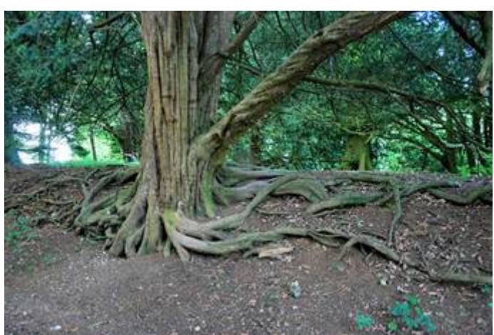
Return to the footpath and up a slight incline where five yews grow along the raised north bank (above right).