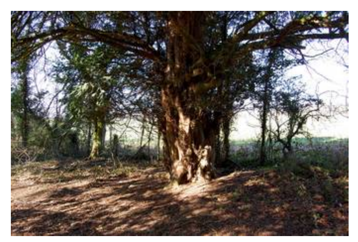
The remaining yews are smaller in girth with an estimated range between 6' and 9'. Over the entire length of this tree lined avenue only one yew stump was observed, this was on the east side.

Continue to the 'No Public Right of Way' notice and then follow the south east footpath, between open fields, for a few paces until the next footpath junction is reached. Turn right heading south west and at the tree line two male yews are seen (below left), the largest girthing 10' 8" at 1'.