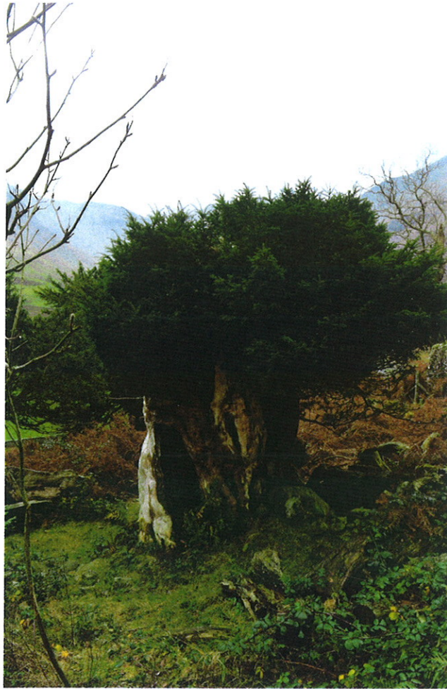
Tree 1 in November 2014. Maurice Pankhurst

Alternative explanations may well involve branch-collapse and layering, whereby the partially broken limb produces roots and the secondary stem is formed. A fine example of this can be found in Ormiston, East Lothian, Scotland. Therefore, if the original trunk fails, the tree is not always lost and may be replaced by younger outlying branches. The root systems of Yews have been shown to exhibit extremely high vitality (Hageneder 2011) and may often give rise to vigorous regrowth; so long as part of the root system remains intact and in contact with the soil, the tree can survive. In the case of the Borrowdale Yews, the fellside above them was extensively mined for graphite over many centuries and falling rock must have been a fairly frequent occurrence and may have resulted in root damage. Further examples of this process can be found in England at Kingley Vale, Sussex, at Bennington, Hertfordshire, and at Coften Hackett, Worcestershire (Peters 2012).