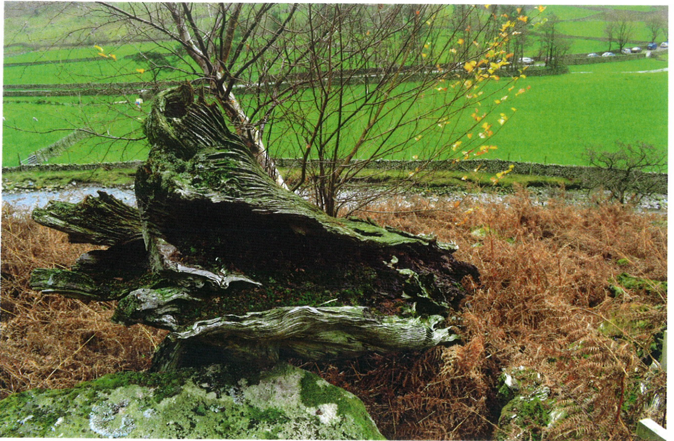
Remains of tree 4 uprooted in 1866. Maurice Pankhurst

In contrast, individuals which originate from basal shoots or branches that have layered produce the same DNA fingerprint (genetic clones). It is this technology that has been used to examine the three remaining Yew trees at Seathwaite. Two approaches, which have been used extensively for clonal analysis of a large number of tree species, have now been applied to the DNA extracted from Yew foliage samples.