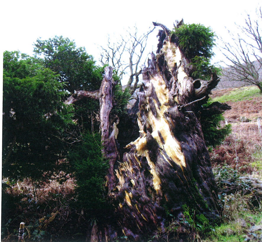
Tree 1 in 2008. Maurice Pankhurst

How those changes have taken place is still a matter of speculation. In other examples, Yews are often recorded with multiple stems. For example, Hartzell (1991) mentions that the Fortingall Yew in Perthshire, Scotland, consisted of a single trunk in 1870 and measured 56 feet in girth. Today, the centre has decayed and a pathway divides the remaining halves.