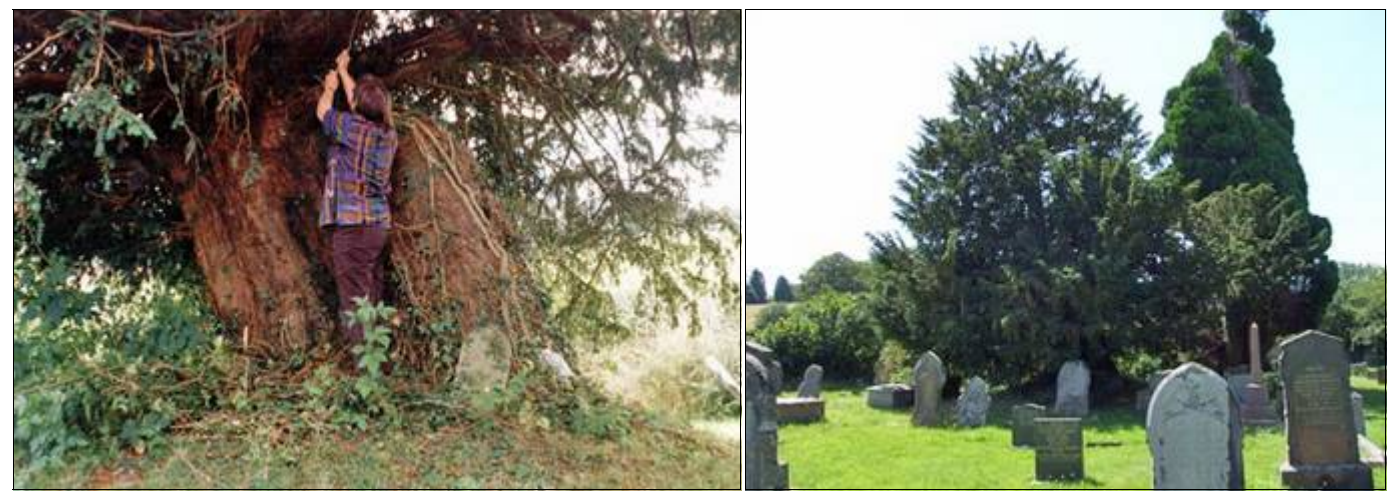
Cilmery Yew in 1999 - Tim Hills

I visited the site of Llanganten church, in the parish of Cilmery/Cilmeri, on 20th August 1999. The yew, which grew SW of the church, was recorded with a girth of 15' 1" around the base. Its bole height was about 5', above which the tree narrowed before sprouting new growth in all directions. A vigorous and healthy yew was noted, confirmed by the photo taken in 2005. Height of the tree was about 25'.