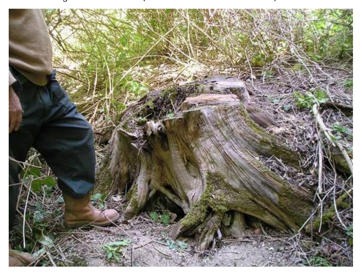
As can be seen the heart wood is lost.

Best ring count obtained (over an area 7 inches across) = 120