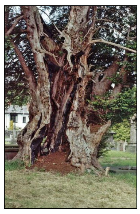
2000 (Tim Hills)

Two years later in 2000 the area around the tree had been cleared, and it once again took pride of place in the churchyard.