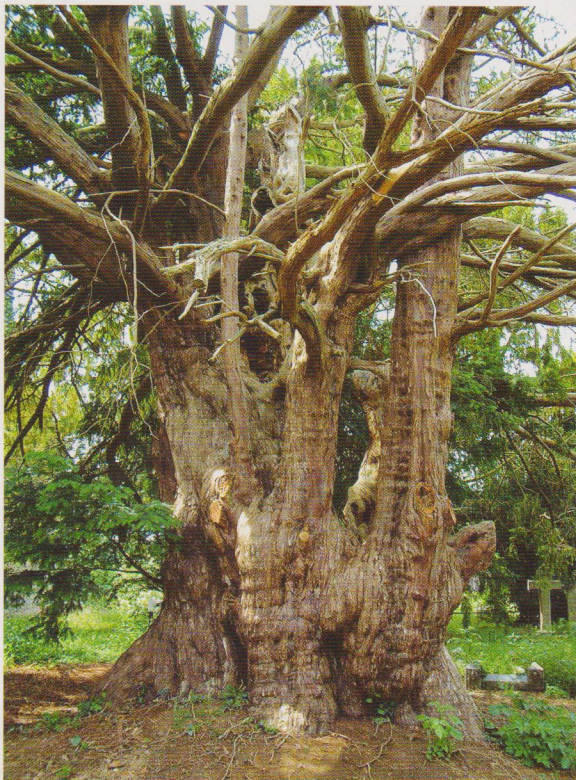
Ashford Carbonell, Shropshire

The web site www.ancient-yew.org is constantly reviewed and updated. 454 new images have been added as well as information on 127 new sites. The gazetteer has been modified to allow an increase in the number of images that can be shown, enabling us to incorporate archive material.