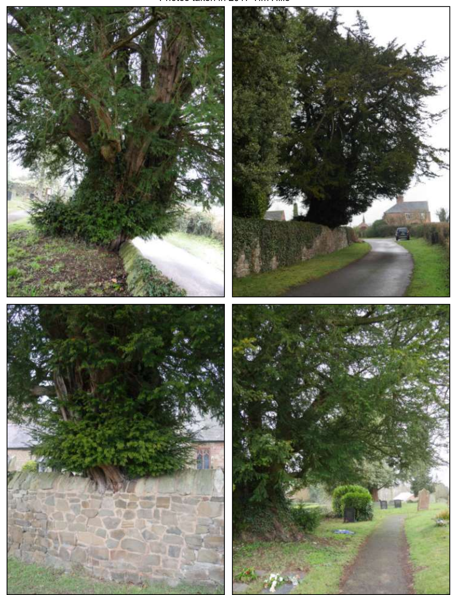
© Tim Hills - Ancient Yew Group - 2019