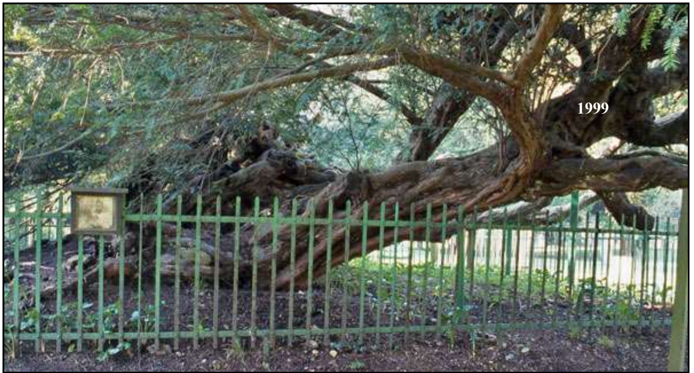
© Tim Hills - Ancient Yew Group - 2019