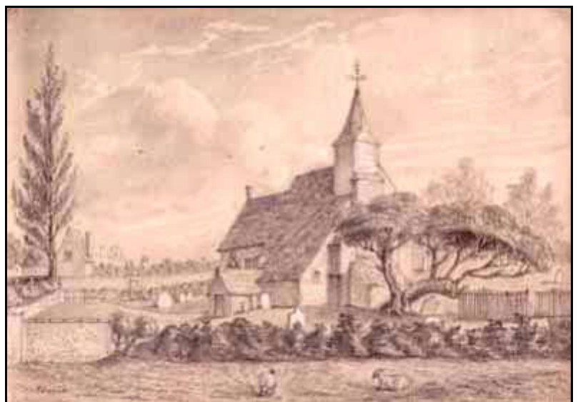
1848 sepia drawing Saunders - Kentarchaeology.org.uk ref