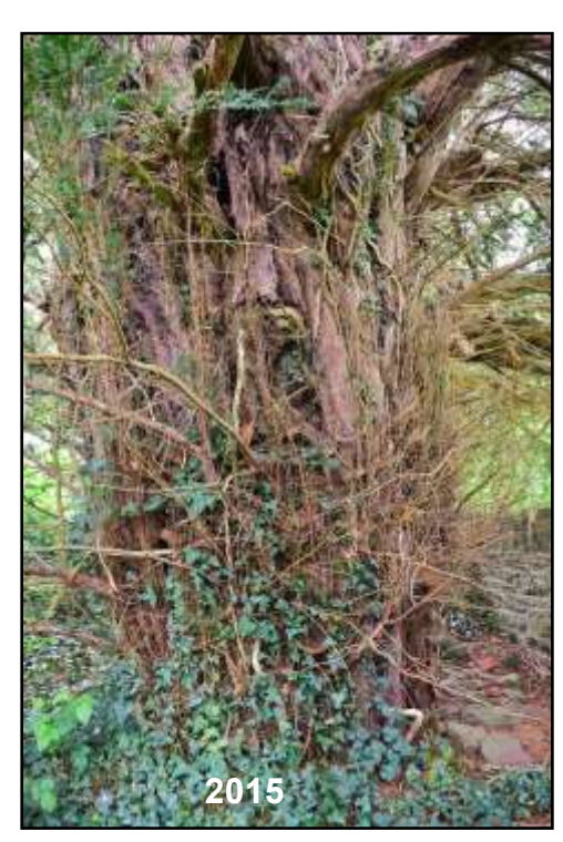
2015: Also noted was this young yew establishing itself on the terrace 10 m east of the church.