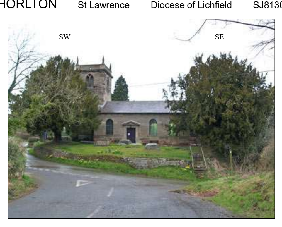
2008: 2 male yews grow on the south side of the churchyard.

The yew SE had a girth of about 16'. It is completely hollow, with new wood wrapping around the old sapwood carcase. A large gap 1' wide on the south side was no doubt caused by the removal of branches that would otherwise overhang the road. Excessive amounts of ivy had been allowed to grow into the branches.