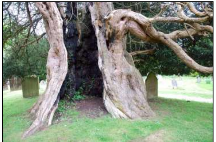
23rd May 2013 Peter Norton: The church was built around 1080. One large hollowed female grows southeast of the church. It has lost some of the outer bole and there is much fire damage to the internal walls. Foliage is sparse on the west side and the branches appear dead, while foliage on the east side appears quite healthy. The girth was 23' 5" at 3' 6", measured from the ground on the north side, top of the slope.