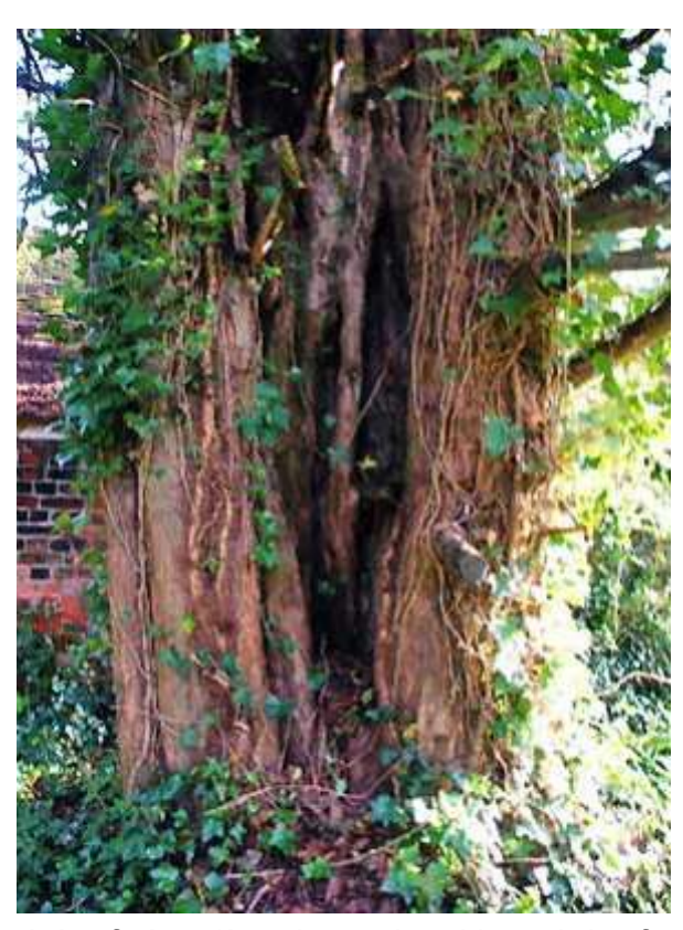
Two further yews grow here, a female by the east gate with a girth of 9' at 1' and a male with a girth of 12' 9" at 1'.