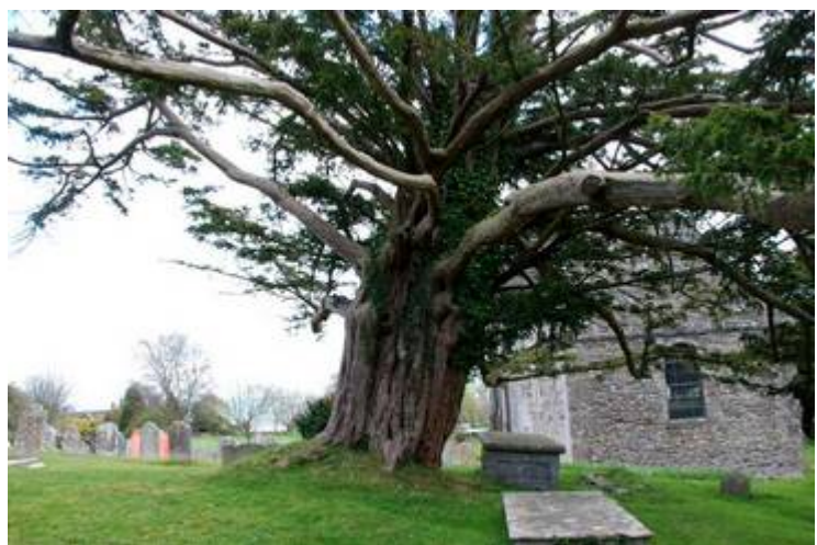
On the south perimeter are three younger female yews, the middle one measuring 10' 2" at 3' and the others less than 8'

Just east of the church three juvenile male yews grow close to the path.