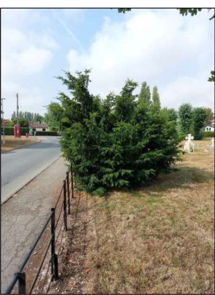
A millennium yew grows 28' NW of the church