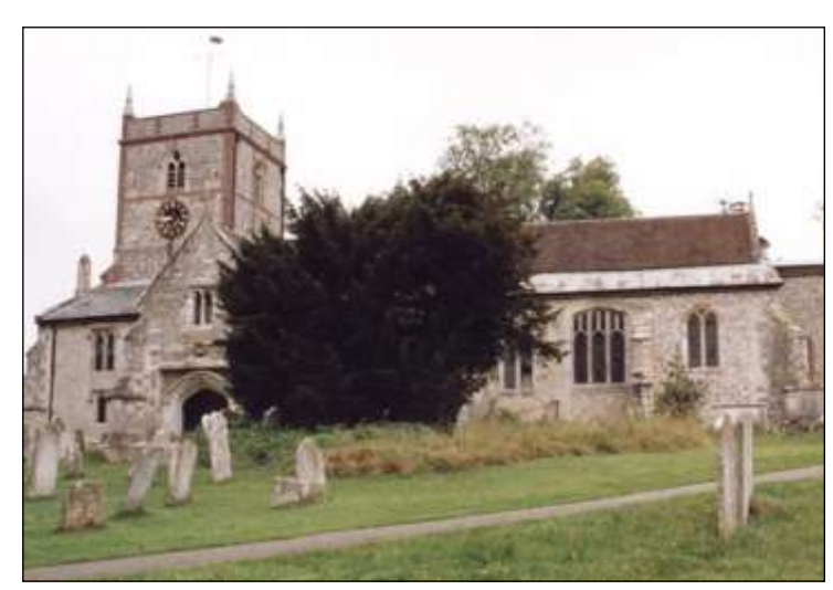
In about 1897 Rev T. White recorded the following measurements for Lowe's Yew Trees of Great Britain and Ireland: 17' at the ground, 18' at 3' and with an 8' bole.

In 1904 it was described in the 1st edition of Little Guide to Hampshire as a 'grand old yew tree, the trunk of which is now nothing but a skeleton'.