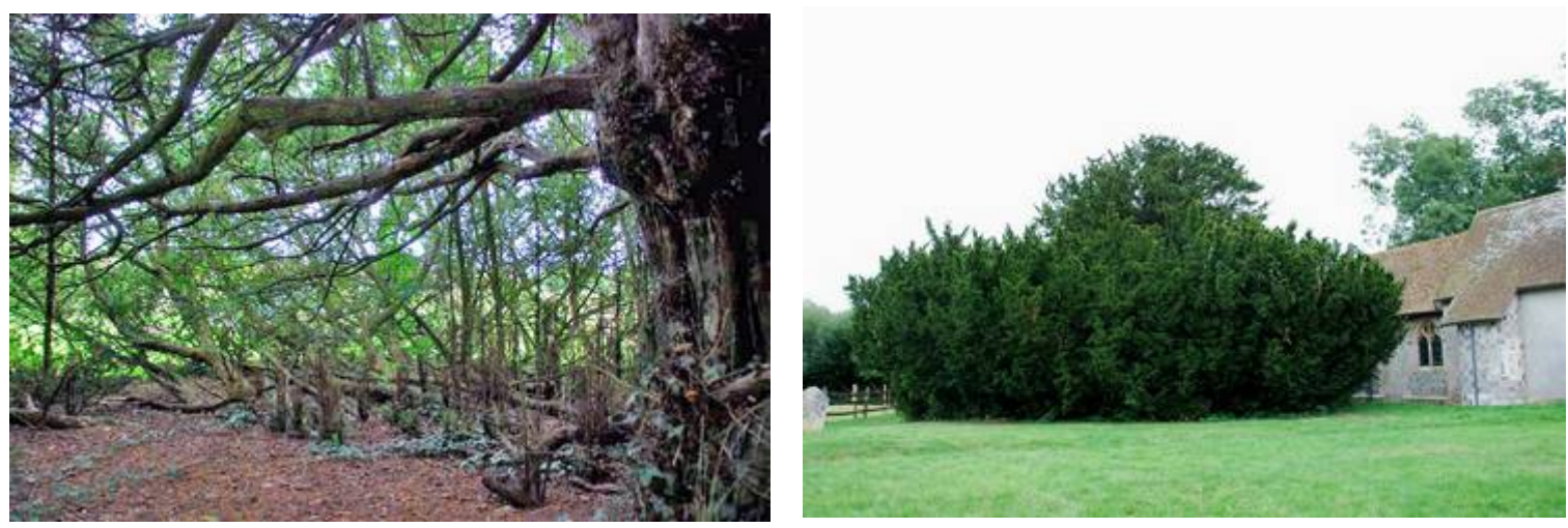
A further three yews, all twin trunked, grow to the east of this tree, with another south of the church

Of five yews growing here the most interesting is just northeast of the north porch. It is a young female with an estimated girth of around 8' to 9'. But it is the copious amount of root generated growth that is of interest, for the tree is surrounded by new growth on the north, west and south sides up to a distance of 20/25ft. Epicormic growth is also noted on all the roots as they snake their way along the top of the ground and then shoot skywards (apical). The entrance to this grove is on the east side of the tree, close to a wooden shed.