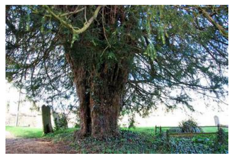
Binsted - Holy Cross - SU771409

A younger male with a girth of 10' 5" at 1' grows just east of the northeast gate.