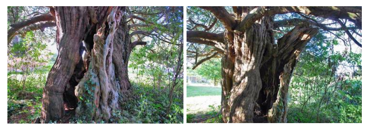
Oakhanger - St Mary Magdalene - SU770363

The following girth measurements are all taken from the ground (as recorded at the south side of the tree adjacent to the foot path which runs alongside). 23' 9" at 6", 22' 8" at 1', 22' 3" at 2', 21' 6" at 3' and 21' 4" at 4'.