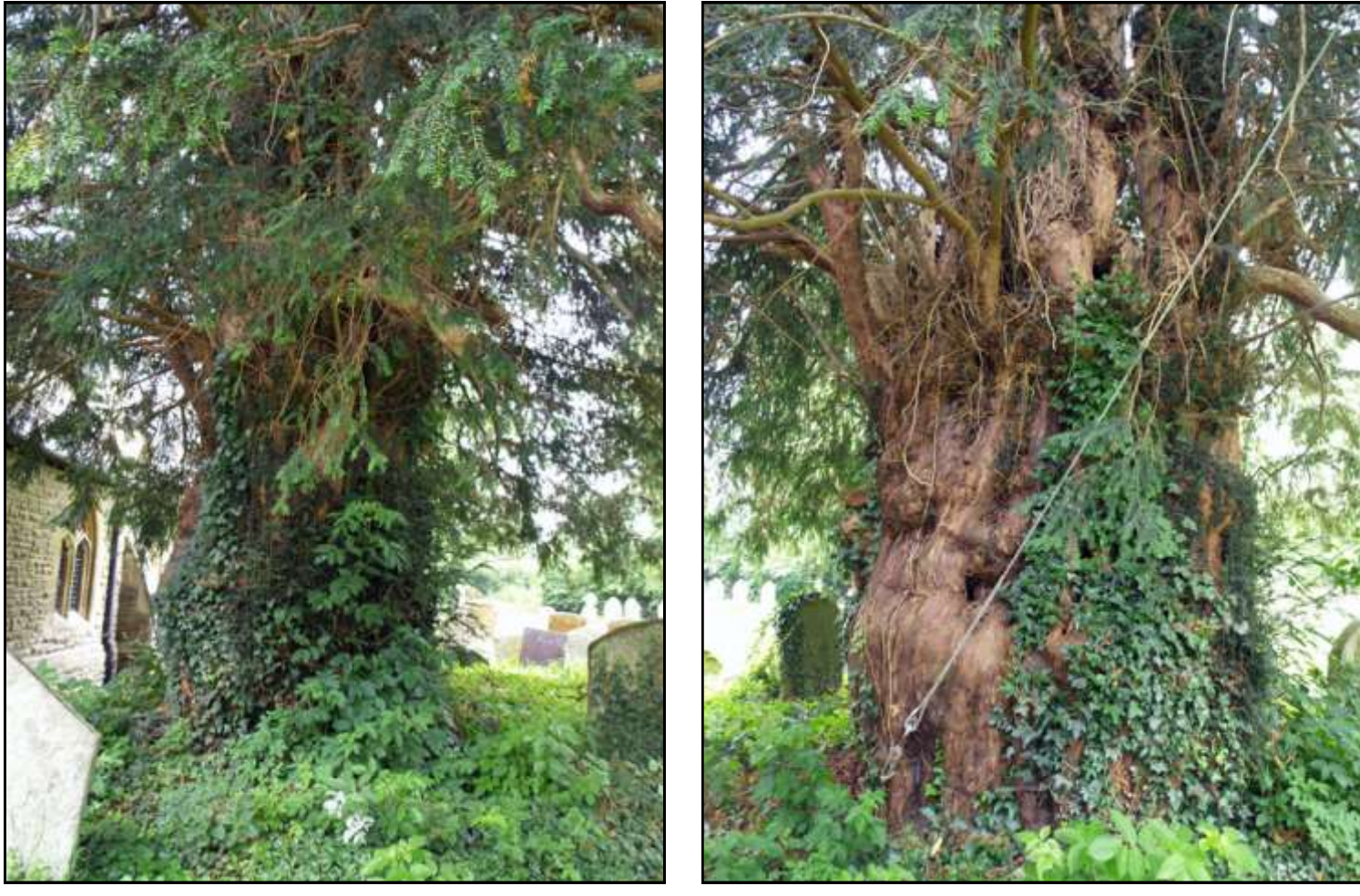
© Tim Hills - Ancient Yew Group - 2019