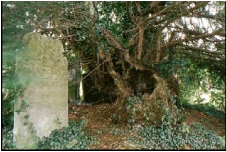
© Tim Hills - Ancient Yew Group - 2019