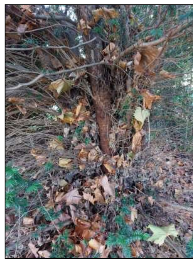
The yew grows 18' west of the church. Girth was 1m 25cm (4' 1") at the ground.