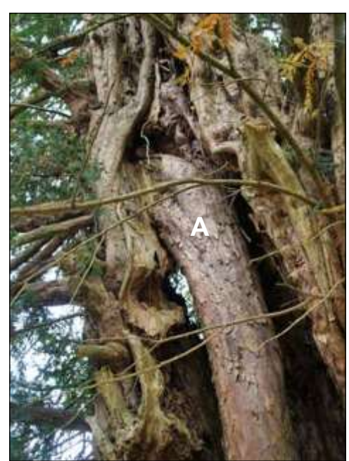
1894: 'The yew on the west side of the tower is probably older than the fabric - the trunk measures 18ft 6ins round at a height of 6 feet from the ground. It is hollow for some 9ft or 10ft high, and in the centre is the distinct stem of a smaller tree which has become merged into the main trunk. Local tradition says that the great yew tree by the tower dates from Anglo-Saxon times'. The Wiltshire Archaeological and Natural History magazine

1938: 'The churchyard has a natural curiosity in the shape of a giant yew tree with a hollow trunk and the trunk of another inside it. The tree is 20ft round, though this includes the beams clamped round with iron bands. We can see the inner trunk through a little hole. About a foot thick it appears to rise straight from the ground, and may be quite a separate yew. Old yew must have been young when the tower was built 700 years ago'. The King's England