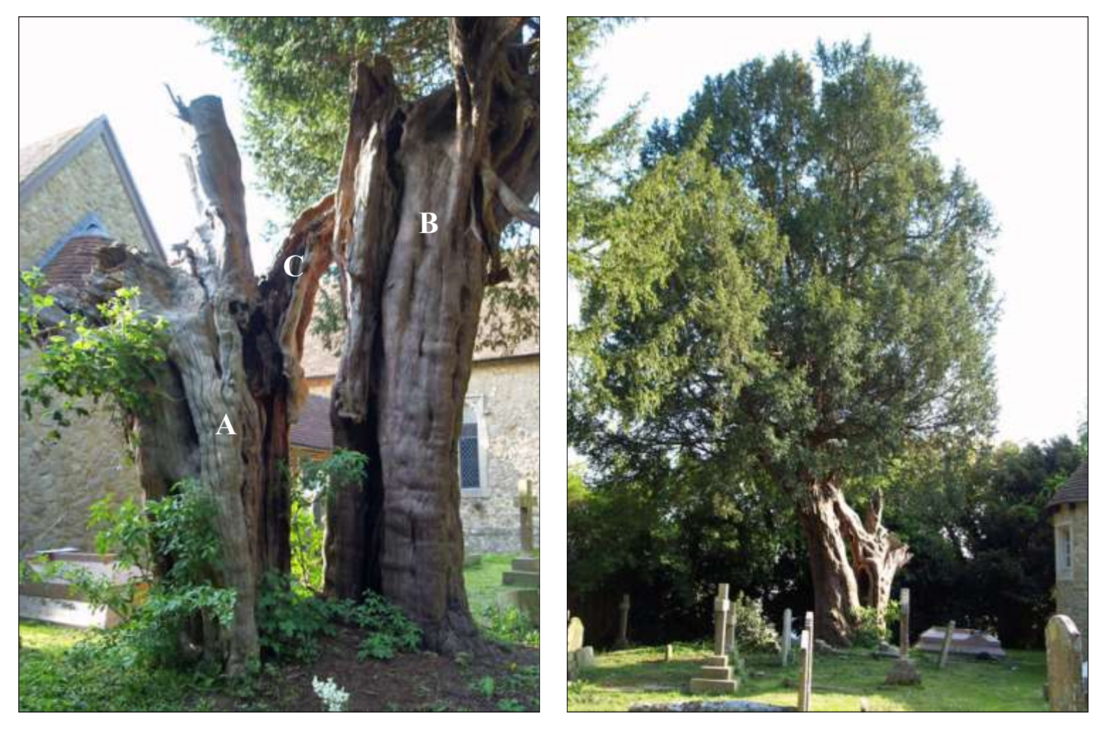
Tim Hills - Ancient Yew Group - 2019

Tree 4, female, grows SE of the church. It appears to be two fragment trees, of which the smaller (A) appears to be dead; however it throws over a branch (C) at a height of about 10' which joins to the main trunk (B). A girth of 18' 2" at 3' was recorded in 2013.