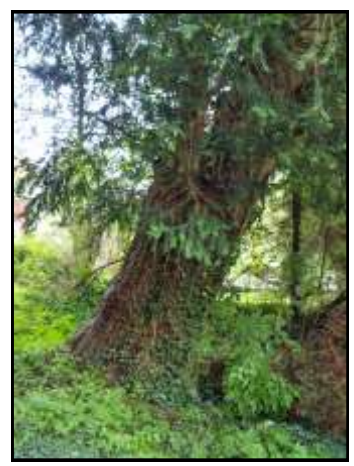
Tree 11 (left) has a girth of between 13' and 14'. Tree 13 (right) measured 13' 5" at 1'.