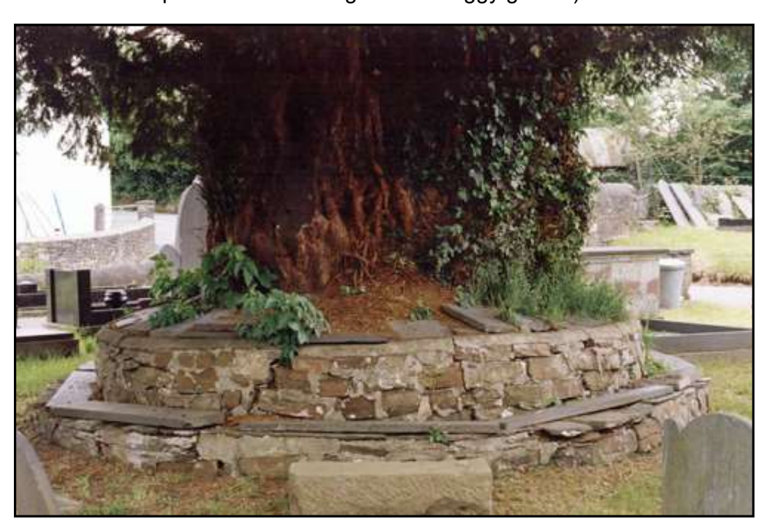
1998 - Tim Hills

1998: One stands out, this large male, its bole visible for half of its circumference, with internal stems seen in some of its hollows. At about 8' it divides into many growth areas, including two main branches. Many substantial lower branches have over time been removed. The wall has been well maintained, but the force of the tree's expansion is beginning once again to produce cracks. Girth was approximately 23' (measured as low as possible and through some twiggy growth).