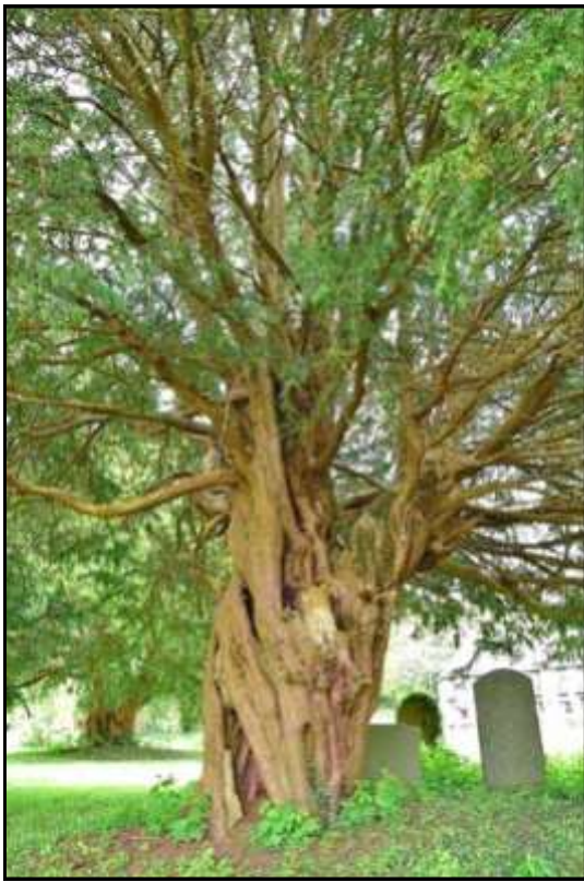
Tree 1 - 2016 - Paul Wood