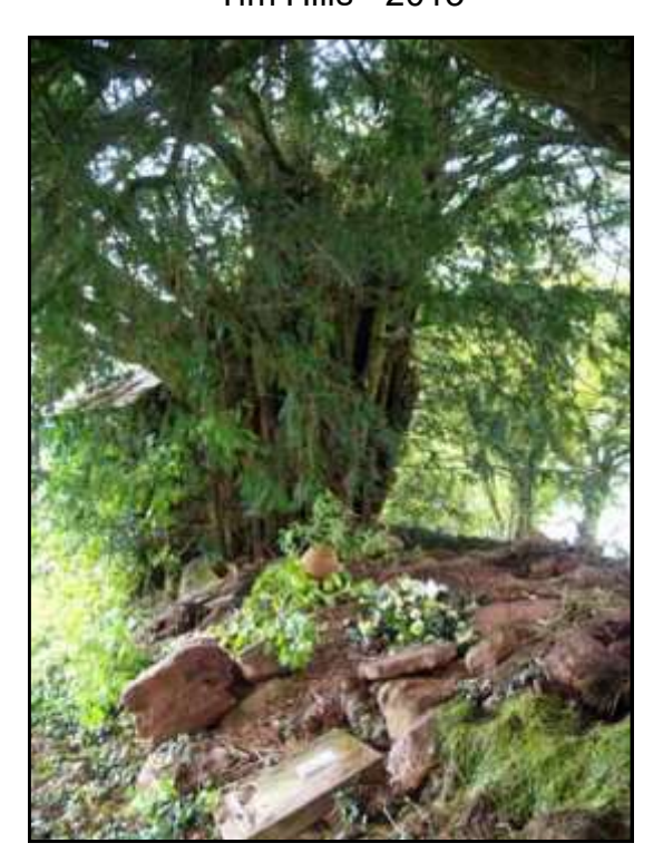
Tim Hills - 2013