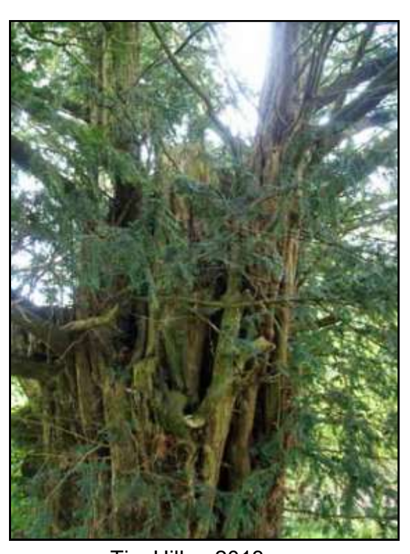
Tim Hills - 2013