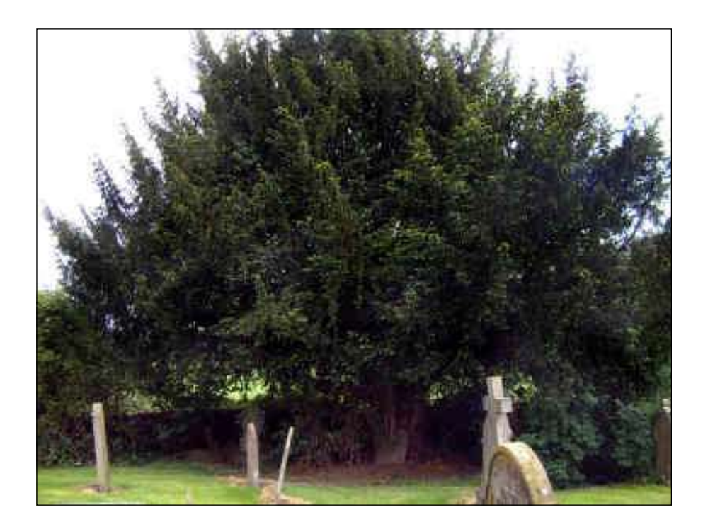
© Tim Hills - Ancient Yew Group - 2020