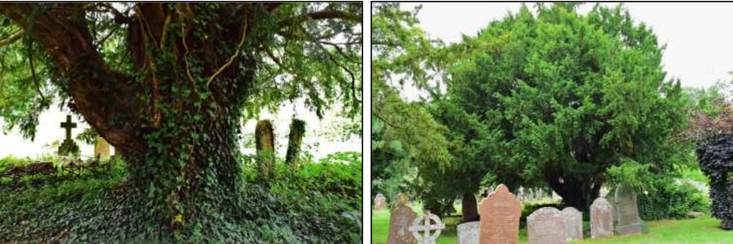
Two younger yews were noted south of this tree on the churchyard perimeter. Girths were estimated at five to seven feet. Also noted on the riverbank 25m from the south side of the church entrance were two yews on the eastern side of the river. Both looked big enough to merit further investigation.