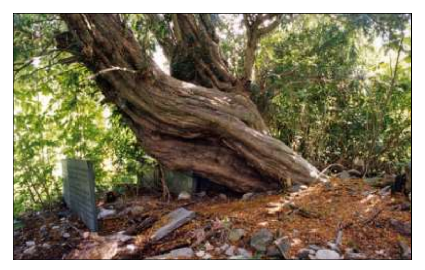
Fragment (B) has become twisted as it gradually arched over. Thin slithers of growth flow over decaying white heartwood. A mountain ash has taken root in it, and already grew almost as tall as the yew. Girth around these fragments was recorded as 30ft in Meredith's Gazetteer in The Sacred Yew (1994).