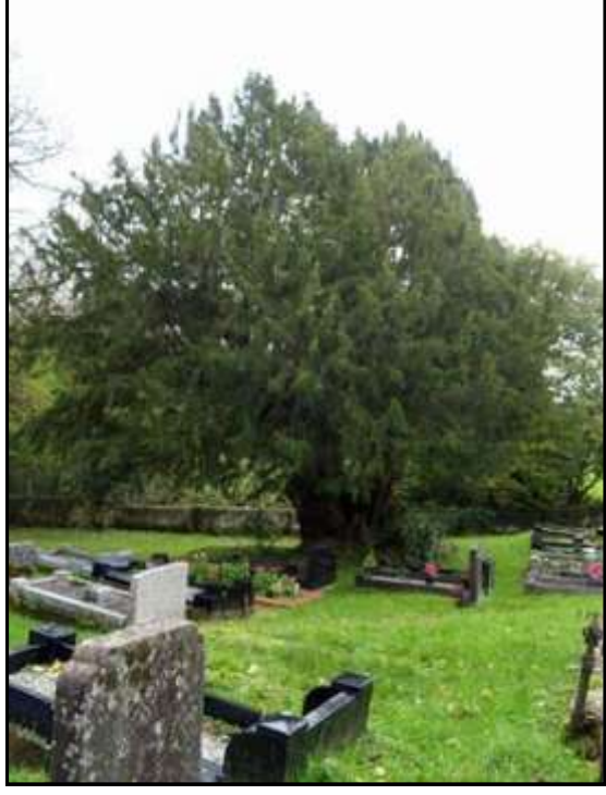
© Tim Hills - Ancient Yew Group - 2020