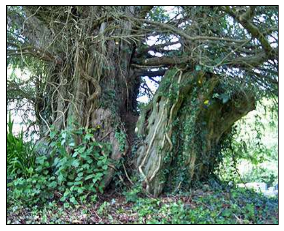
The yew is seen above in 2006 and below in 2013

Inside the living part of the yew an acorn must have germinated probably more than 100 years ago. In 2006 a huge oak was trying to squeeze out of its confines within the yew, and in several places oak and yew branches and foliage were mingling high into the canopy. I looked forward to photographing this phenomenon when I returned in 2013, but in the intervening years the oak had collapsed and brought down one side of the yew. Girth recorded on both occasions was about 23'.