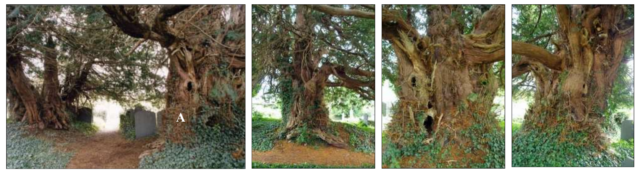
Tree 4 grows SW of the church and close to the road. It is on a raised patch of ground and several thick stems rise from its hidden bole. It was not possible to measure.

The 6 on the plan (A) grows directly opposite tree 5, on the south side of the path at the east entrance. The first photo shows it in 1998, the others are from 2014. From its bole, with an approximate girth of 19', three main areas of growth have developed.