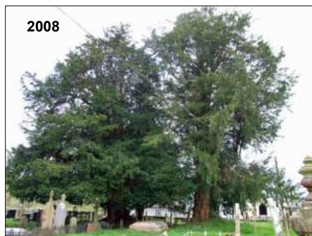
2008 photos - Geoff Garlick