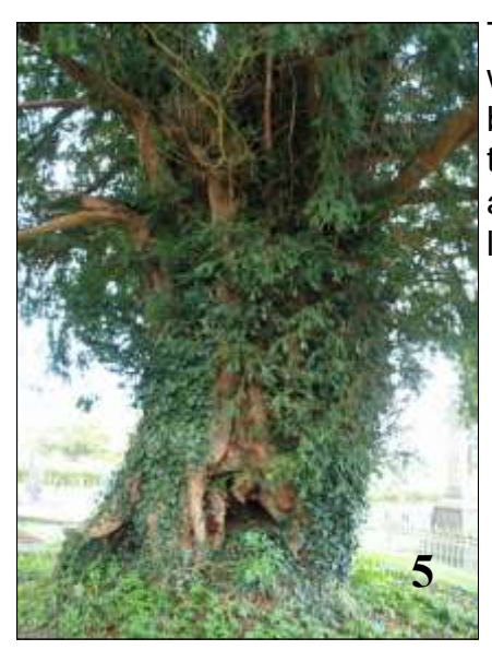
Tree 5: A hollow male with a girth of 20' 4" at the base in 2013. Portions of the bole have been lost and the tree has been larger girthed.