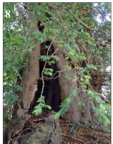
Tree 8: A hollow female with internal growth and a large piece of the old trunk revealing a once larger tree. Girth between the ground and 1', including a piece of stump, was 19' 5" in 2005 and 19' 7" in 2013.