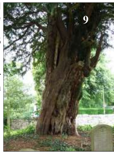
Tree 9: A hollow female which has been larger girthed. Has a complete circle of growth above a height of about 6'. Girth of 13' 5" in 2013.