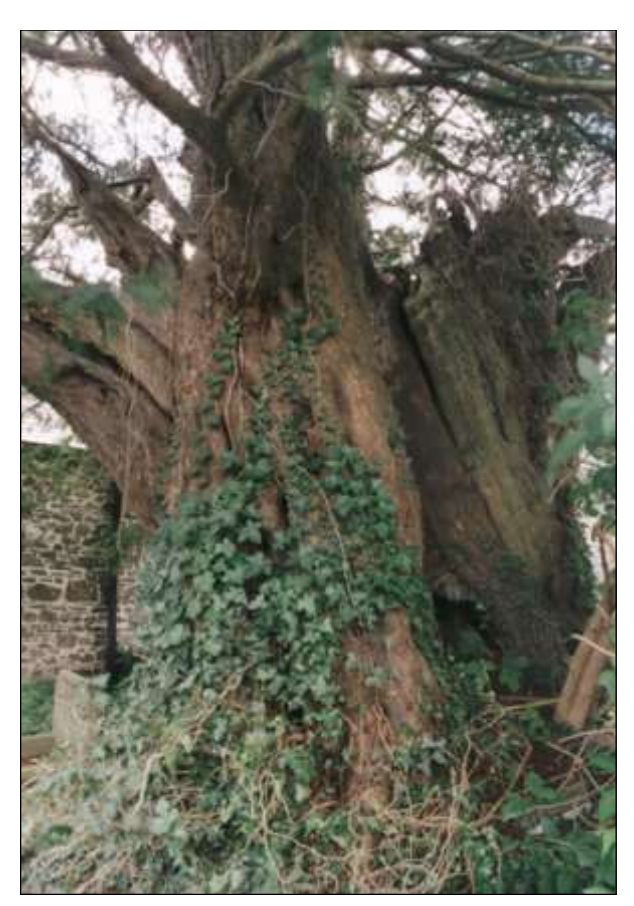
© Tim Hills - Ancient Yew Group - 2019